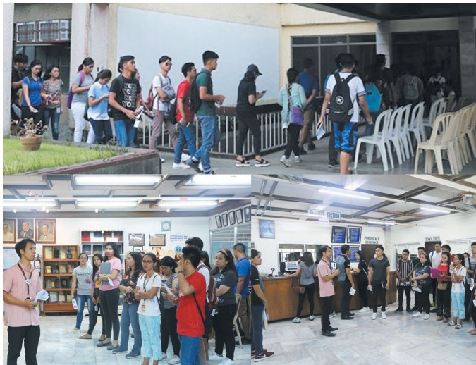
Freshmen Library Tour

JLDM Library provides library orientation and instruction every beginning of the semester. This is to discuss the following policy, different sections and the librarian and staff, print and non-print materials. Guiding them on how to maximize the use of library resources.