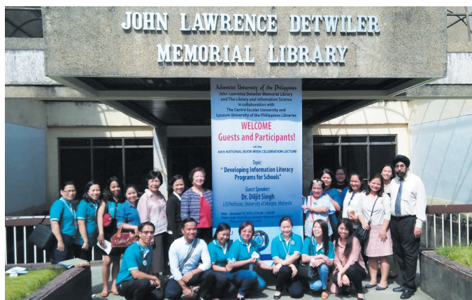
A pose with the Speaker and Participants from different libraries in CALABARZON in front of JLDM Library.